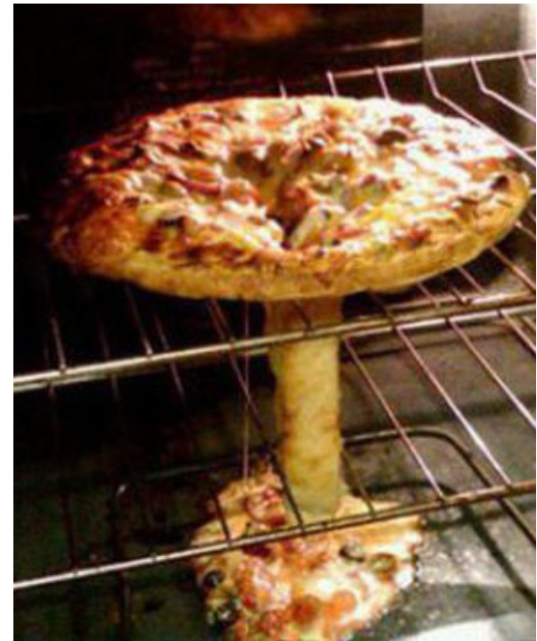
At least the car wasn't moving faster, or a massive explosion of toppings and body parts and who knows what could have ensued.